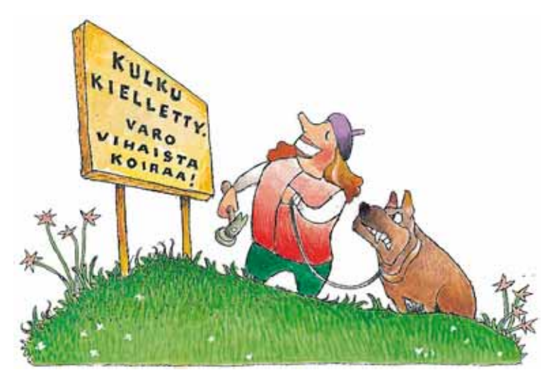
"NO RIGHT OF WAY. BEWARE OF THE DOG!"

Sports events, and other activities involving large numbers of people, should not be organised solely on the basis of access to land under everyman's right, if there is a risk of damage or disturbance to property or nature. It is advisable to agree on these with the landowners.